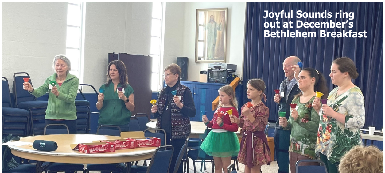
Joyful Sounds ring out at December's Bethlehem Breakfast

The explanation following, "What Does This Mean," comes from the " Small Catechism ." Written by the Rev. Dr. Martin Luther in 1529, the little book is treasured still by the world's 84 million Lutherans for clearly opening the Bible's truth and celebrating the heart of the Christian faith. Translation by Concordia Publishing House, St. Louis ©1992.