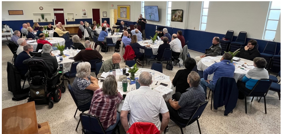
(photo) January 22 mission conference gathered leaders from our 10 Suncoast sister churches . "Spirit, will You lead us to birth a new church ?"