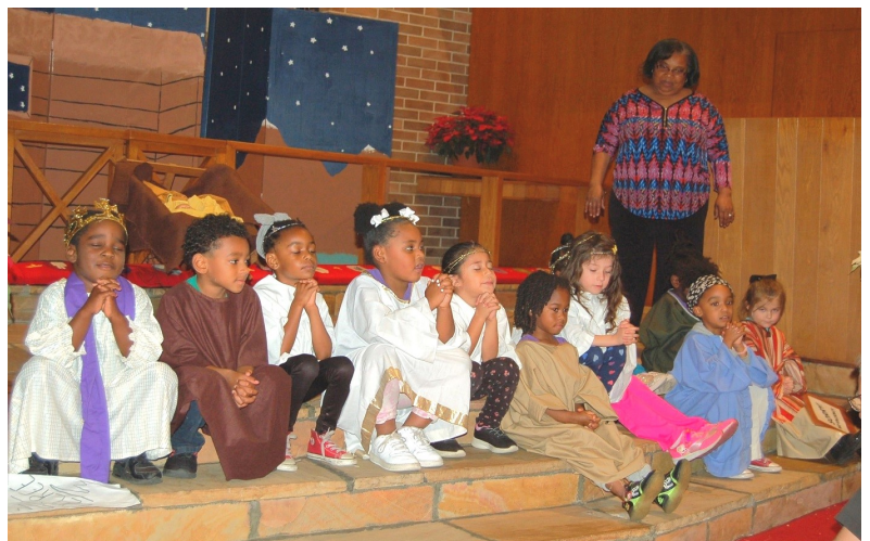
With Concordia's helpers, A New Beginning ECC (our campus partner) presented their preschoolers' Christmas pageant. "Glory to You, manger born!"

"Thank You, Lord, for Your snowbirds! Bless also their home churches, our faithful sisters."