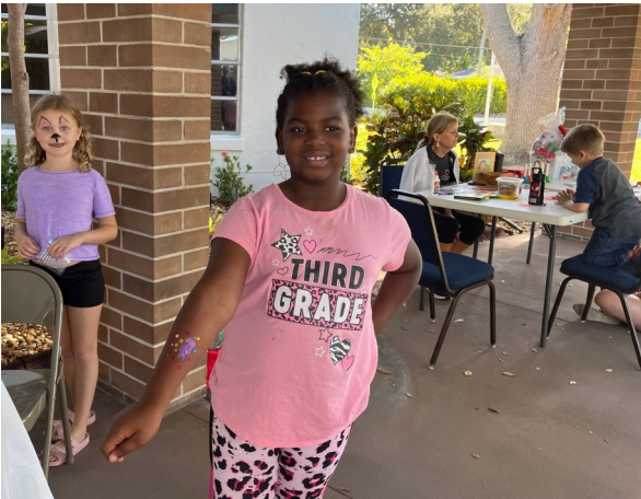
3 photos - November's Craft Festival