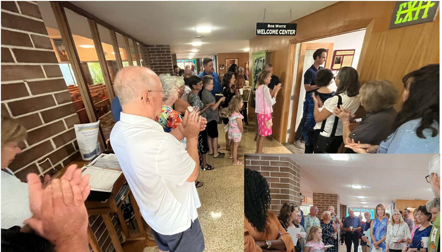
Welcome Center Dedication