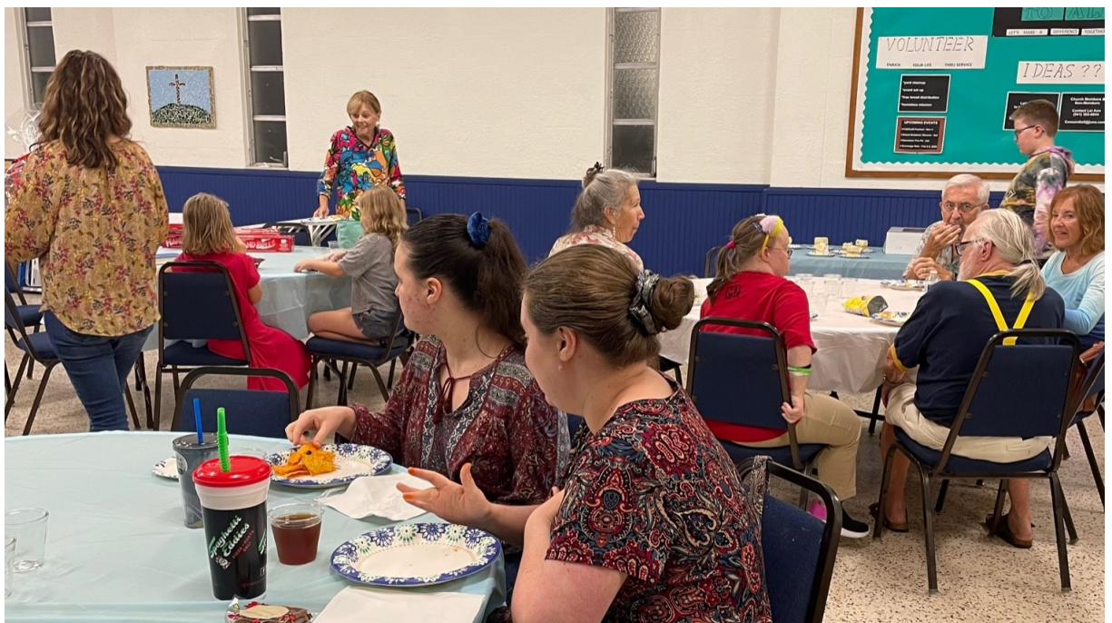
2 photos: November 16's Family Night - dinner, Bible story, music and craft