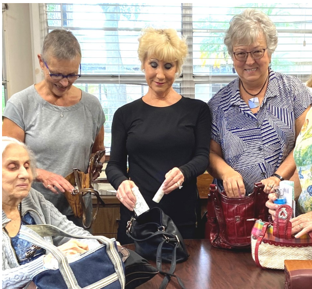
Some of the Concordia women packing purses with loving gifts for SPARCC and Redeeming Life shelters (photo above)

Non-Profit Org. U.S. Postage Paid Manasota, Florida Permit No. 1230