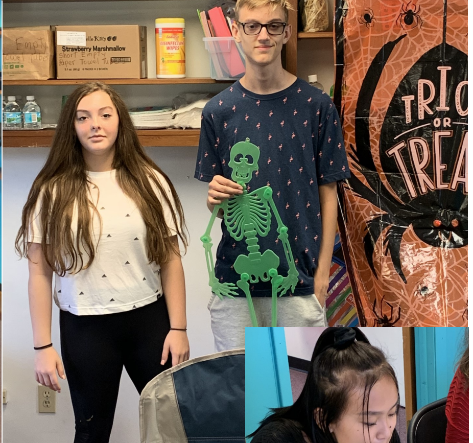
Youth Group... bring friends!