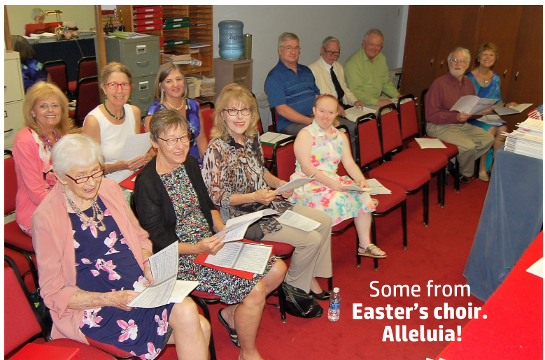
Some from Easter's choir. Alleluia!

" Spirit , give to our minds the Father's wisdom, our hearts Jesus' love!"